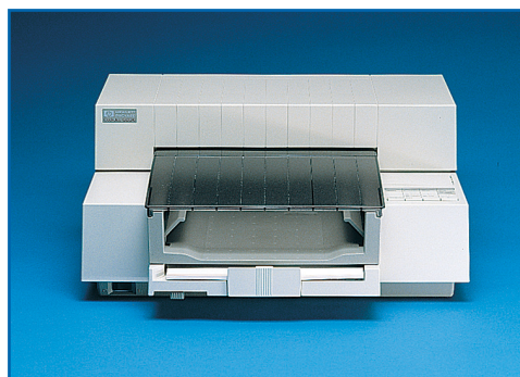
Full InkJet Support

A PC running Windows 95, 98, 2000, ME, NT or XP with the minimum Windows requirements and 20 MB of hard disk space.